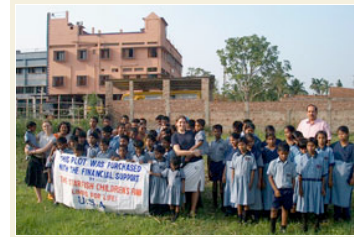
Students, teachers, and founders at The D.F. Blind School in Calcutta, India

Content maintained by External Relations